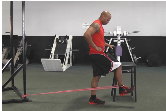
Figure 2-1. Final holding position for Exercise #1.

Using Exercise #1 as an example, when you watch the video you will notice that Figure 2-1 shown below represents the final holding position for this exercise and is to be held for 10-15 seconds - the right leg does not repetitively go forward and back, again and again, as you would normally do with weights. This is very important because isometric training using the resistance band is a very efficient way to train your muscles for speed and strength and as a result all of the exercises outlined in this program are done this way.